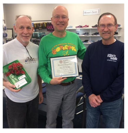
Metro Run & Walk