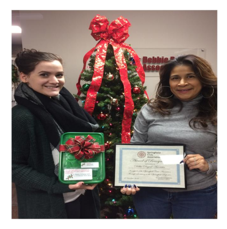
Debbie Dogrul Associates