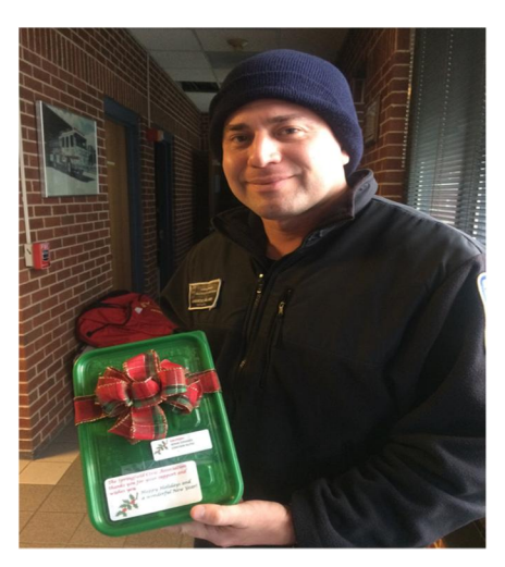
Springfield Fire Station