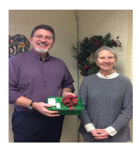
Grace Presbyterian Church