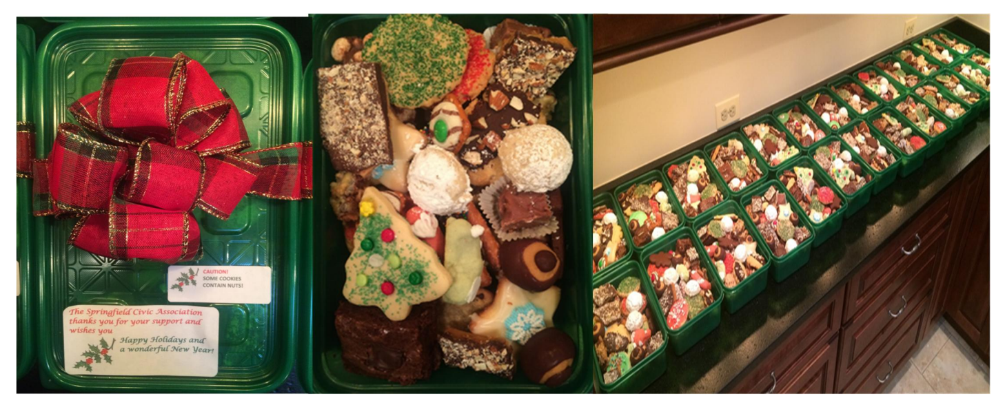
See all the cookie recipients with their cookie boxes on pages 14, 15, and 16.

Members of the SCA worked together to bake and deliver cookie boxes to all of the businesses and people who supported and advertised with us in 2018. Volunteers put together 24 decorated boxes for delivery. Every box contained two pounds of delicious, homemade cookies, brownies, toffee, brittle and bark.