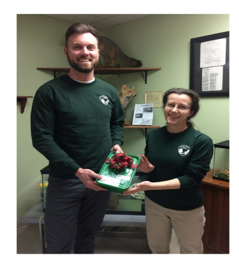
Lake Accotink Park