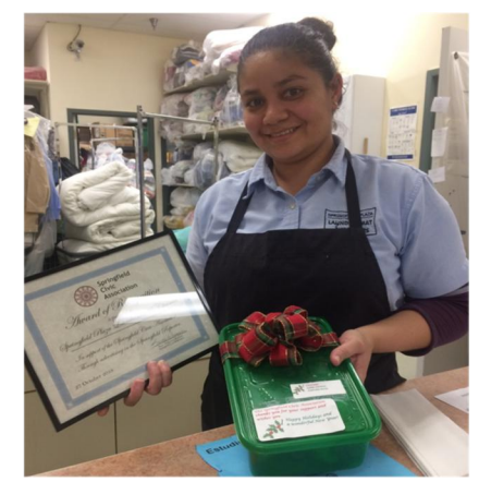
Springfield Plaza Laundromat & Cleaners