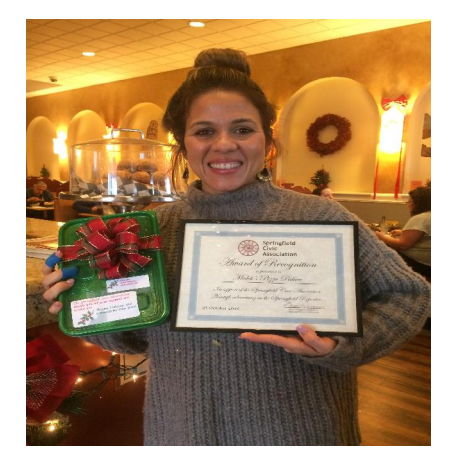
Malek's Pizza Palace