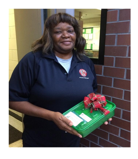
Franconia Police Station