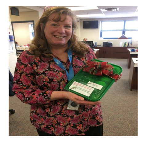
Crestwood Elementary School