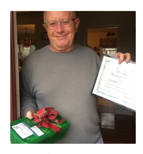
Springfield Swimming Club