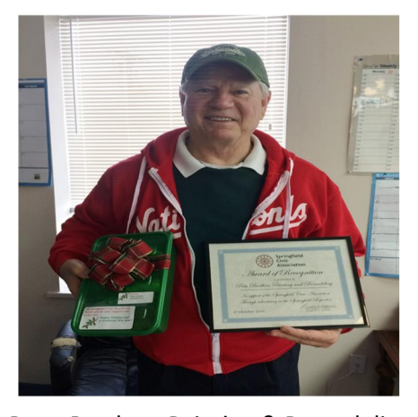
Potts Brothers Painting & Remodeling