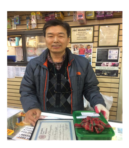
LA Mart Springfield