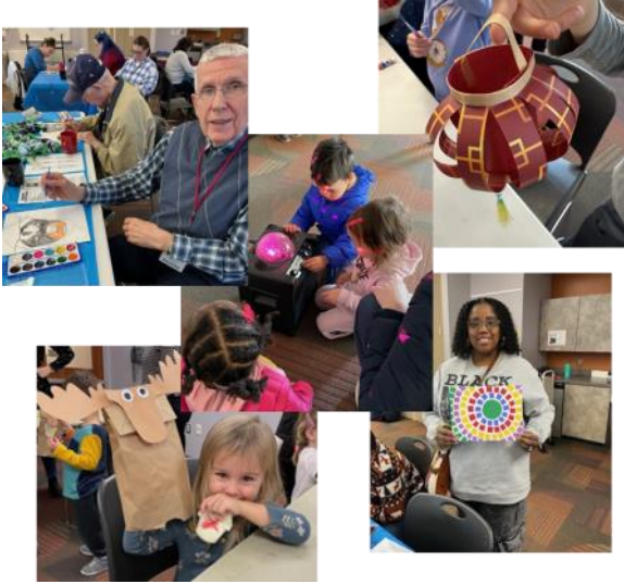
Top left. Pet Portrait Painting. Top right. Lunar New Year craft program. Center. Preschool STEAM: Light and Shadow. Bottom left. Preschool Storytime. Bottom right. The Art of Alma Thomas painting program.

Greetings from Richard Byrd Library! There's always something new happening at the library!